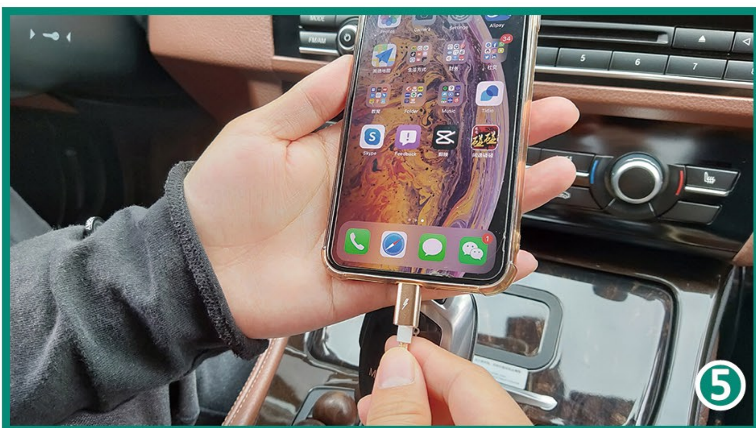
5, Then connect with iPhone.