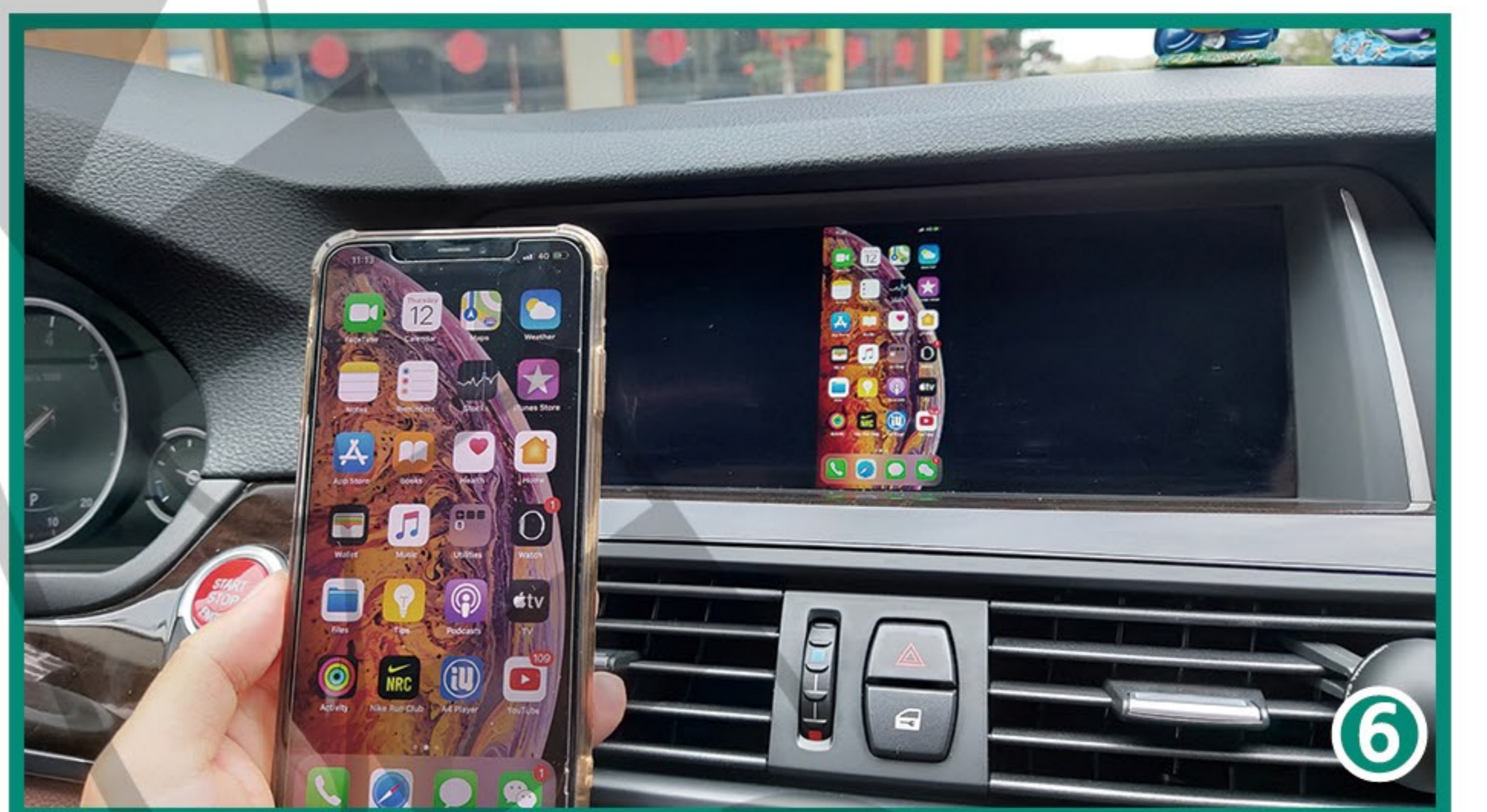
6, iPhone will get trust request. click Trust, Then all job done, Enjoying..