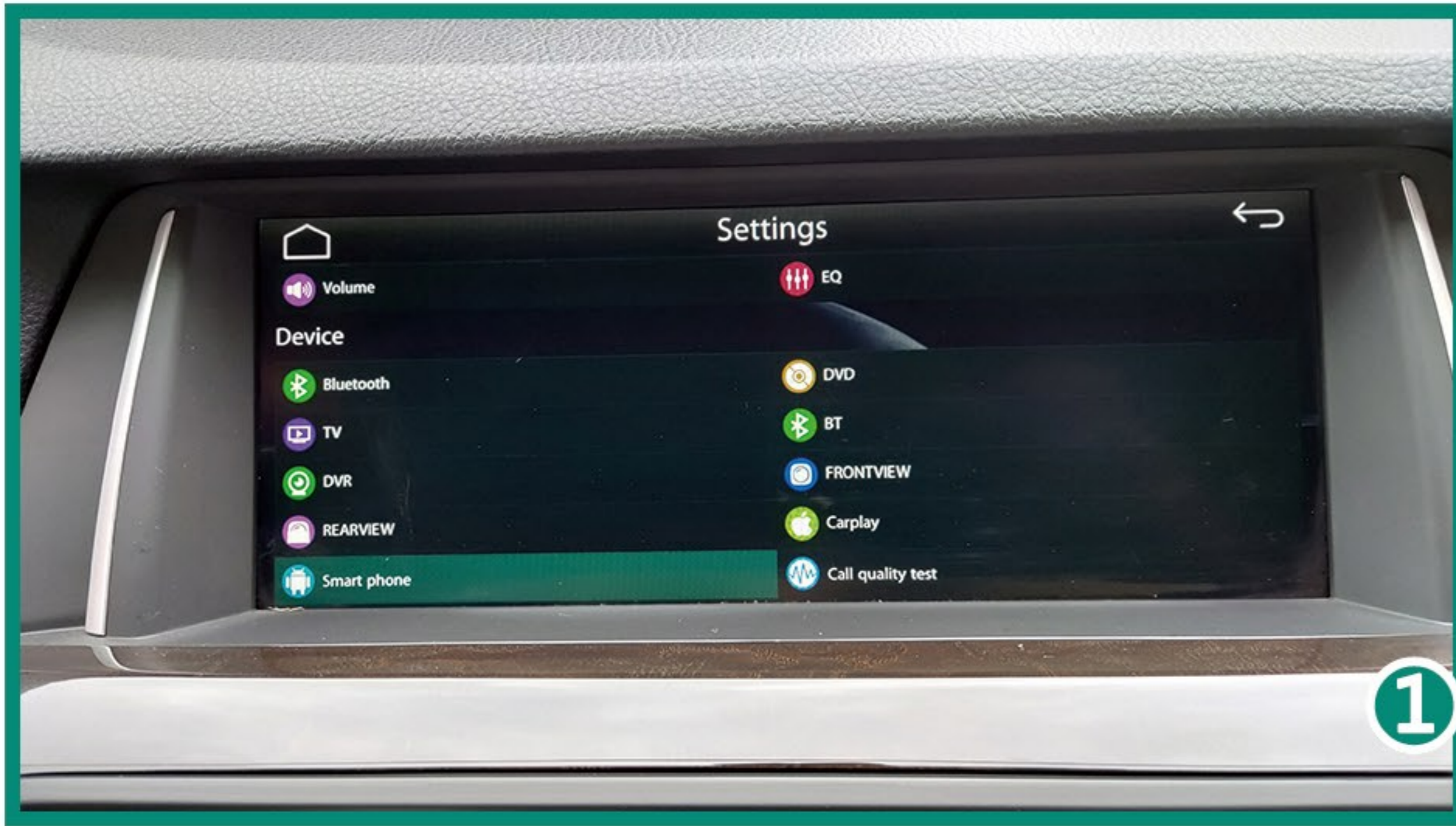
1, Go to setup, select Smart phone.